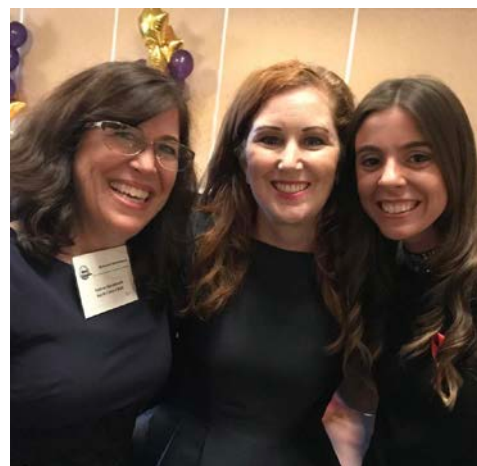
Photos from the 2017 live ceremony